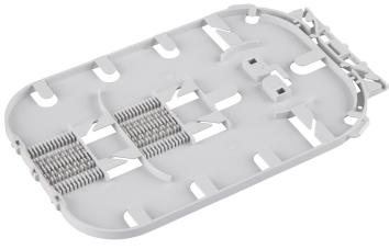
TENIO™ Splice Tray

Splice trays Order separate splice trays to complete unloaded or partially loaded closures.